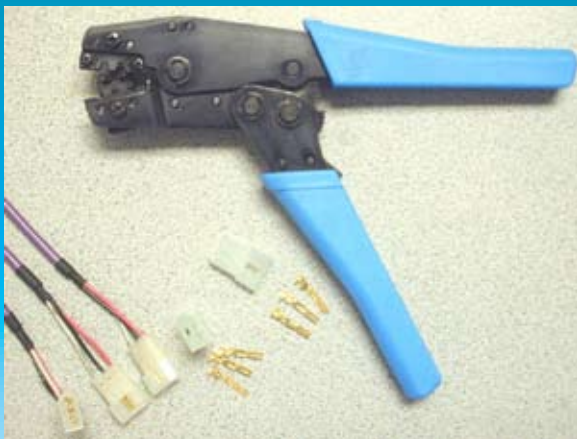
easy to use crimp tool

uses popular 3 pin Elco latching connector